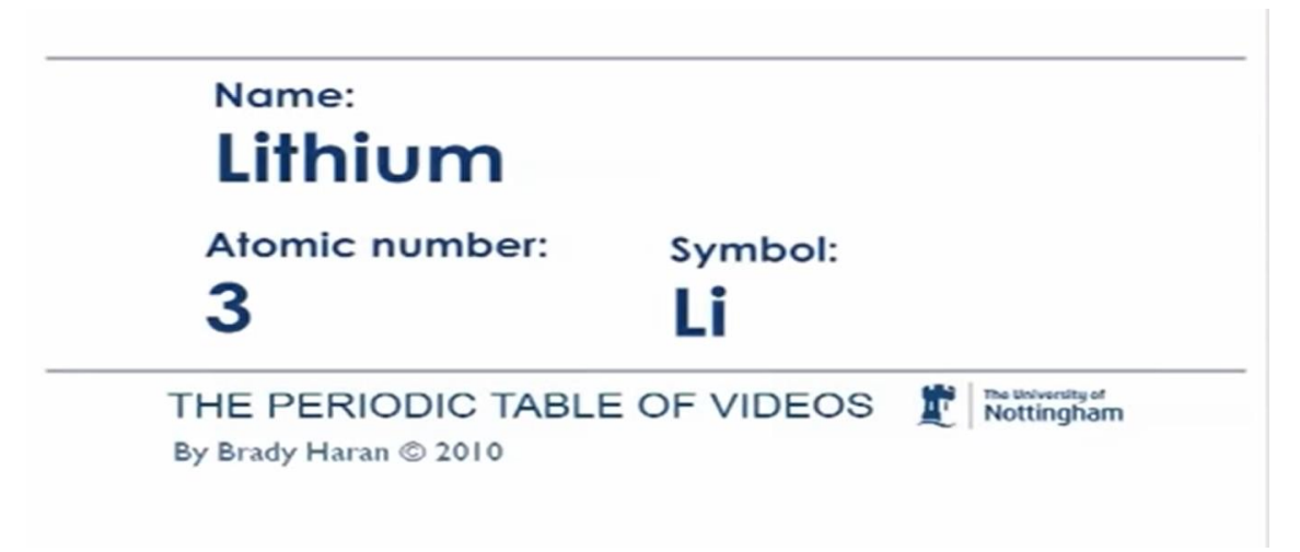
Fig.2 - https://www.youtube.com/watch?v=wY0afMI4Jgc&t=159s