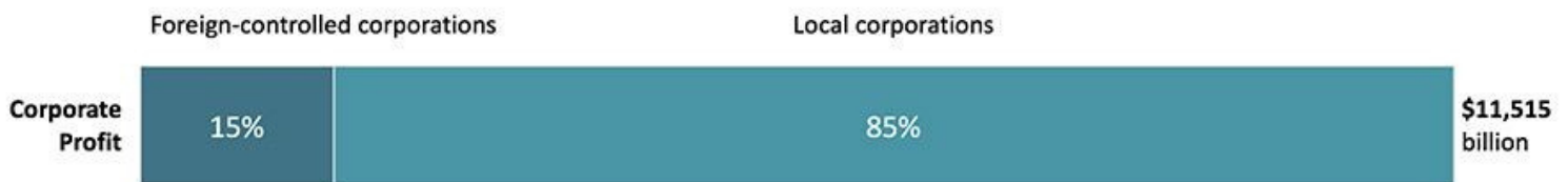
The most important tax havens of the world

$616 billion is declared in other tax jurisdictions, of which 92% goes to just 11 tax havens