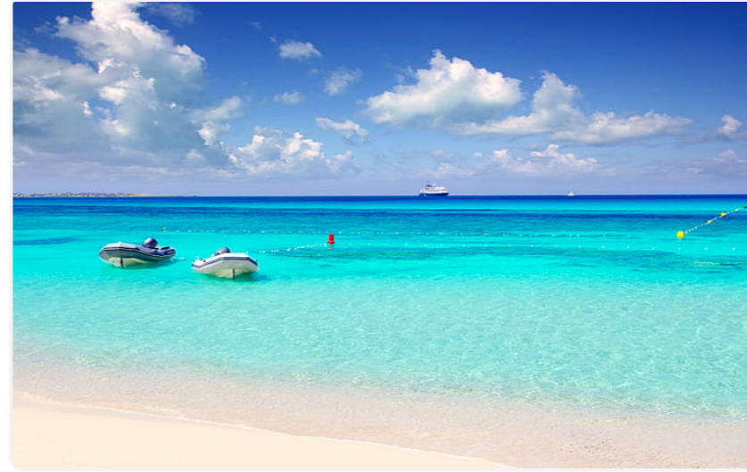
Names of oceans/seas