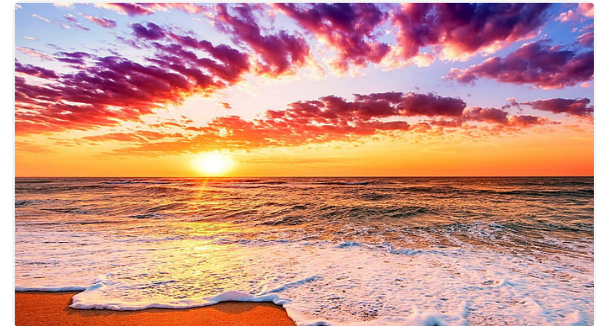
Importance of oceans