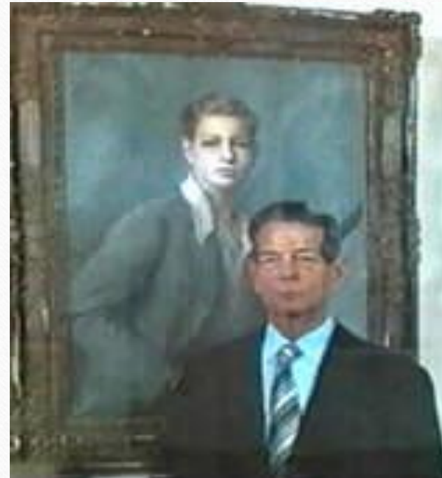
King Michael I

Romania fought against the AXIS until the end of the war. The change of camp by Romania meant for Germany the loss of the main source of oil.